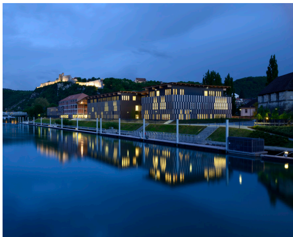
Frac Franche-Comté, Cité des arts, Besançon © Kengo Kuma & Associates / Archidev, photo : Nicolas Waltefaugle

The Fonds régional d'art contemporain de Franche-Comté (Franche-Comté contemporary art collection) is one of the 23 Fonds régionaux d'art contemporain created in 1982 within the framework of the state decentralisation policy.